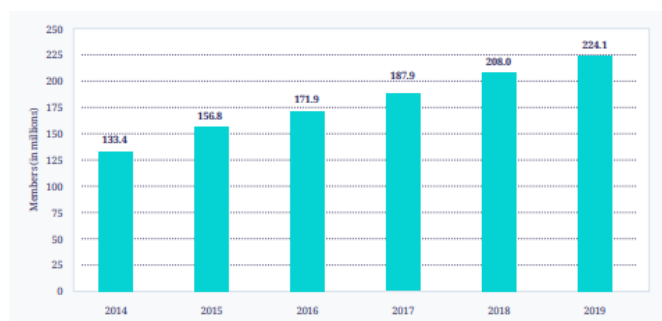
Figure 1. Coverage of Indonesia’s JKN, 2014–2019