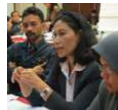
Participatory workshops in Bangkok and Jakarta