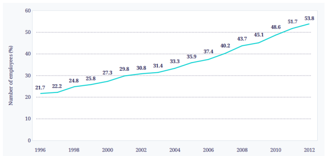
Figure 2. Trends in number of employees contributing to social security in Brazil, 1996–2012